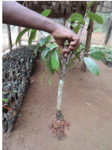
Figure 4: Marcotts shooting