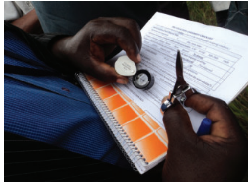
Figures 12 and 13: Demonstration of the cut test procedure