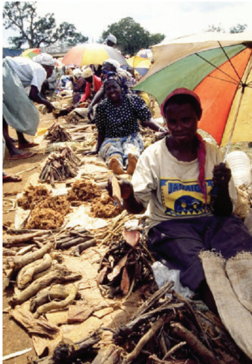
Figure 1 : Commercial herbal preparations from Warbugia species.