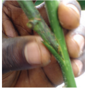
Figure 6: Side grafting