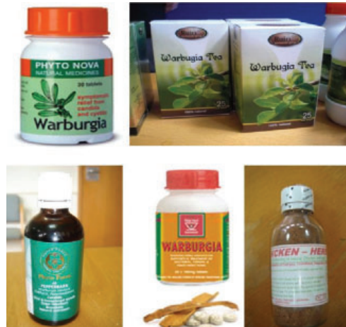
Figure 2: Traditional herbal market. Dried Warbugia bark on sale.

She noted that there is very little documentation on Warbugia as a biopesticide. There are, however, reports from Kwale, Kenya that hanging maize cobs and treating them with Warbugia stuhlmannii smoke protects them from weevil attack. The high phytoactivity recorded from various extracts from the tree points to a great possibility of wide usage of this species in pest control. The few studies that have been documented show scientific evidence that Warbugia ugandensis is active against a number of phytopathogens (Tables 2).