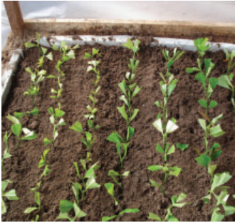
Figure 5: Cuttings