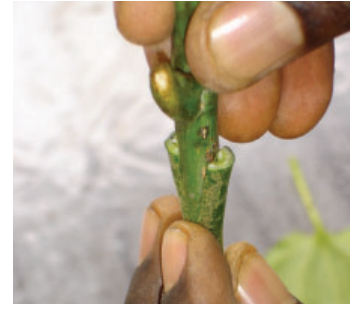
Figure 7: Top grafting