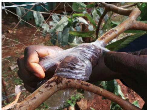
Figure 8: Demonstration of Marcotting.