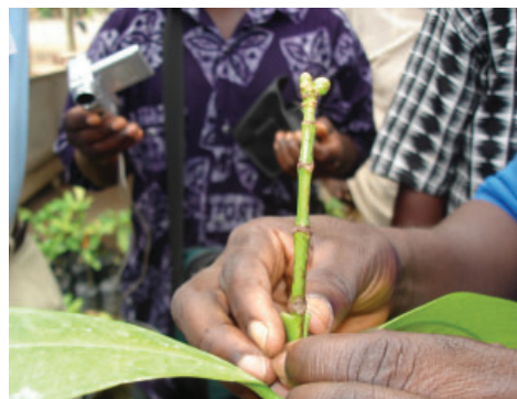
Figure 9: Demonstration of grafting.