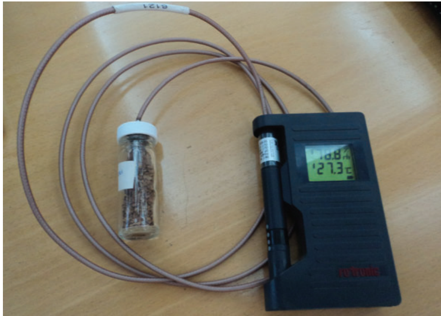
Figure 14: Measuring of seed moisture content using a hygrometer

Dr. Gold talked about the water binding regions and that water in seeds is of three types: