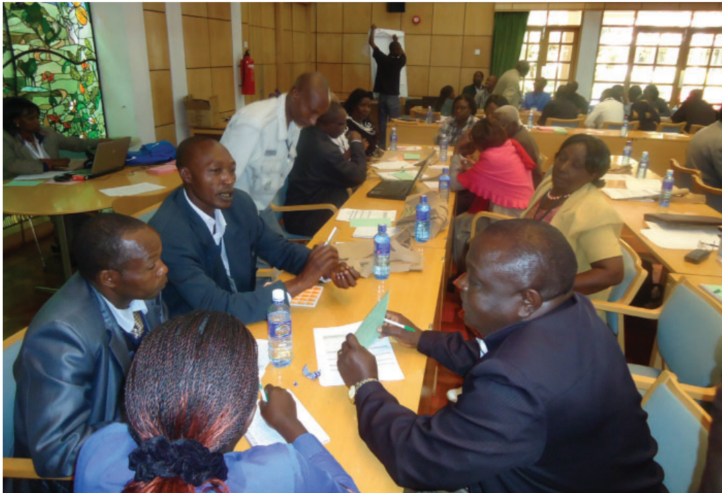
Figure 11: A group of the participants during the discussion.