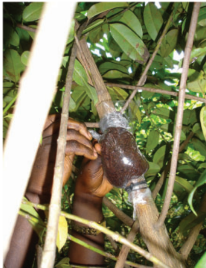
Figure 3: Marcotting