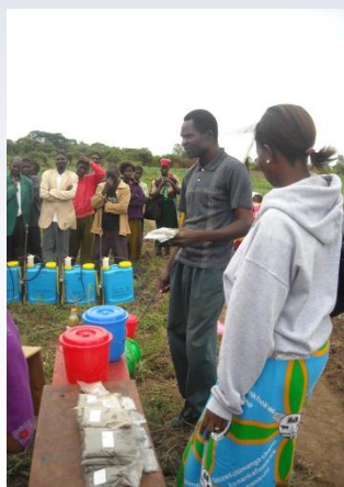
Farmer trials of pesticidal plants provide an opportunity to train farmers in their preparation and demonstrate their efficacy

Policies related to regulation, bio-diversity conservation, health and safety directives and commercialisation of pesticidal plants will be developed. Research carried out across Africa will be empowered by ensuring pesticidal plant technologies are properly focussed on current constraints and strongly linked to the needs of end users, civil society and enterprises. Institutional and policy levels across countries will be strengthened by encouraging debate and consensus over best practice guidelines, and the need for formal regulatory frameworks regarding the protection and utilisation of indigenous knowledge, bio-diversity conservation, health and safety and the commercialisation of pesticidal plants and overall environmental protection.