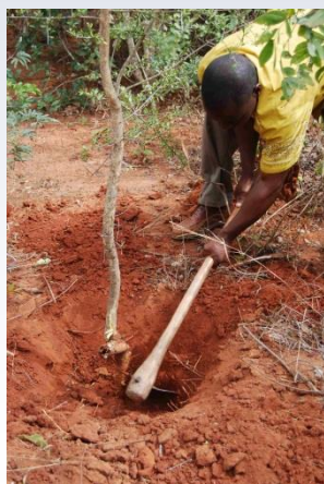
Propagation of Securidaca longepedunculata will reduce pressure on natural woodlands and unsustainable harvesting of the root bark.