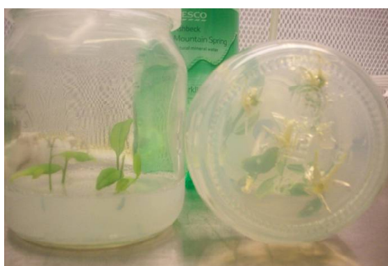
(c) Rooting on B5 liquid media + 0.1 mg/l of IBA and NAA

Figure 2. a: Axillary shoot multiplication and rooting in S. longipedunculata ; b: Explants cultured on vermiculite and paper pulp (B5 liquid media with 0.1 mg/L of NAA and TDZ) never produced roots; c: Explants cultured on B5 liquid media supplemented with 0.1 mg/L of IBA and NAA rooted after 4 weeks.