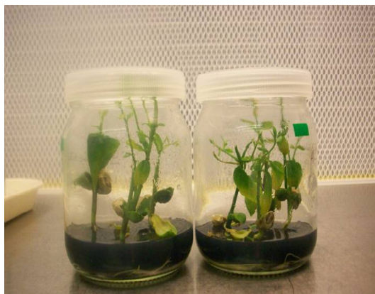
(a) Axillary shoot multiplication