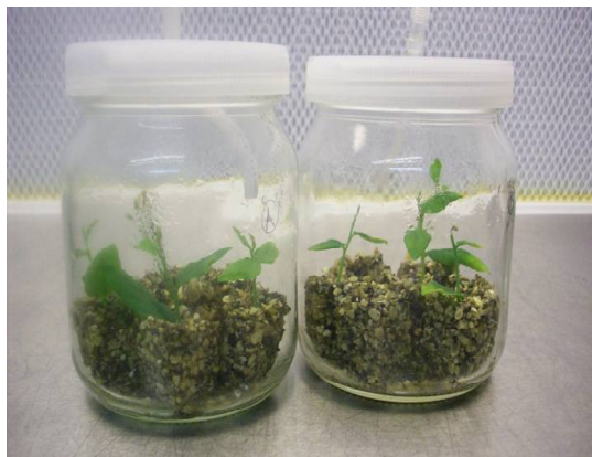
(b) Explants cultured on vermiculite and paper pulp